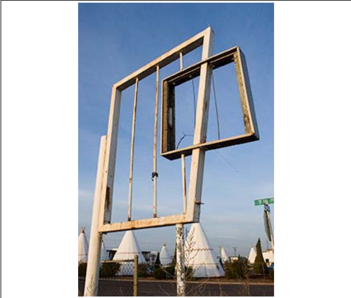
Figure 3a. The 20 mm lens darkened the corners, which is especially noticeable in the sky.