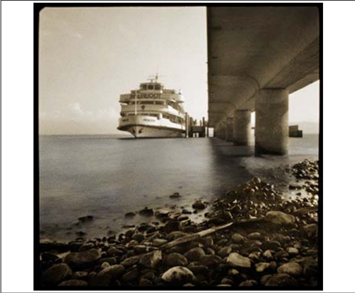
4-8 A four second exposure with a pinhole camera and extensive digital darkroom work created this over-worldly image.