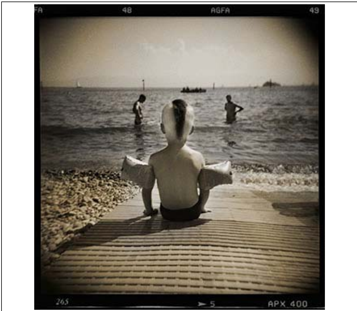
4-9. Photographed with a Holga camera, which adds a unique quirkiness to the scene that was accentuated with multi-toning and extensive dodging and burning.