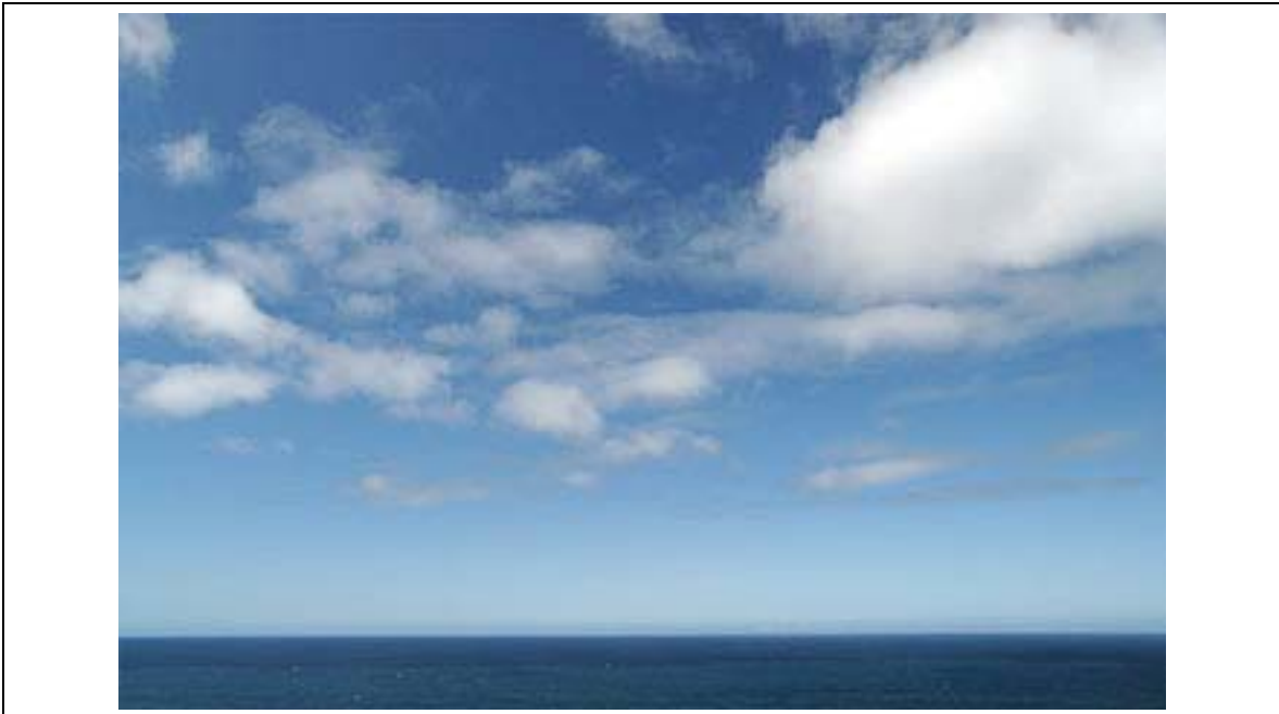
Figure 2b. After processing the image in DxO Optics Pro the horizon line is flat and the image is evenly exposed.