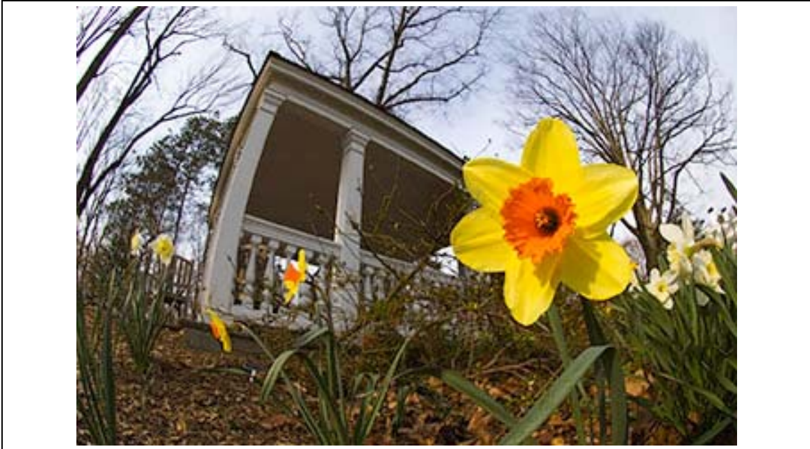
Figure 6. Photographing with a superwide 10.5 mm lens allows the daffodil to dwarf the gazebo.