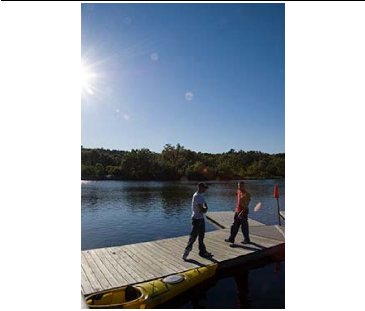
Figure 5a. In this example the flare is distracting.