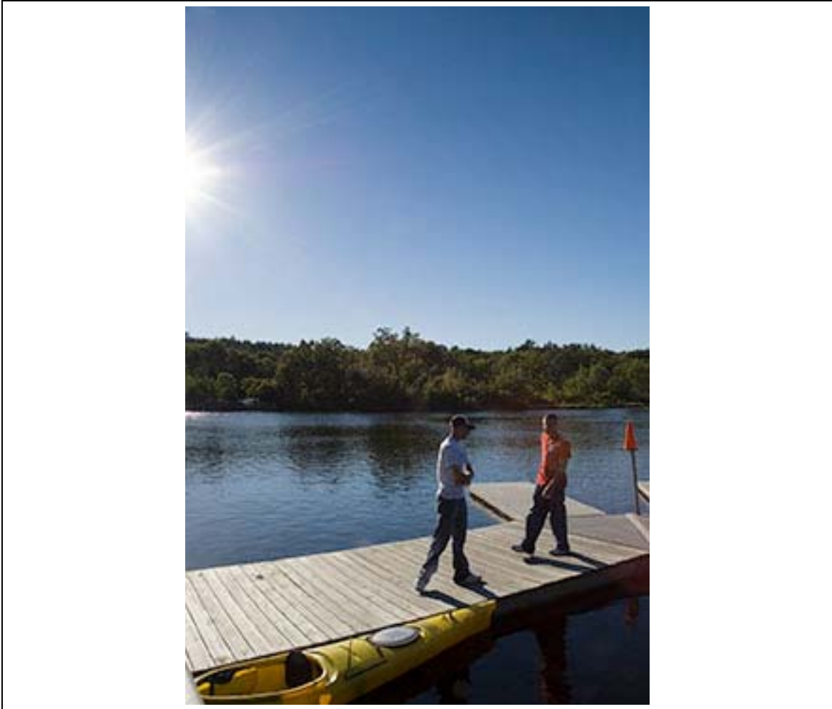
Figure 5b. Removing the flare reduces the distractions.