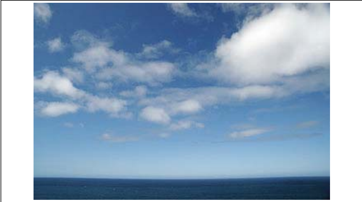
Figure 2a. The lens used to photograph this scene created distortion and edge vignetting.