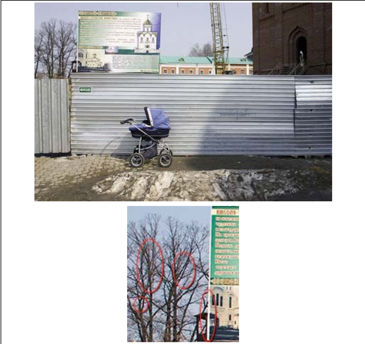
Figure 4-a. Chromatic aberration is apparent when viewing a file at 100 or 200% view.