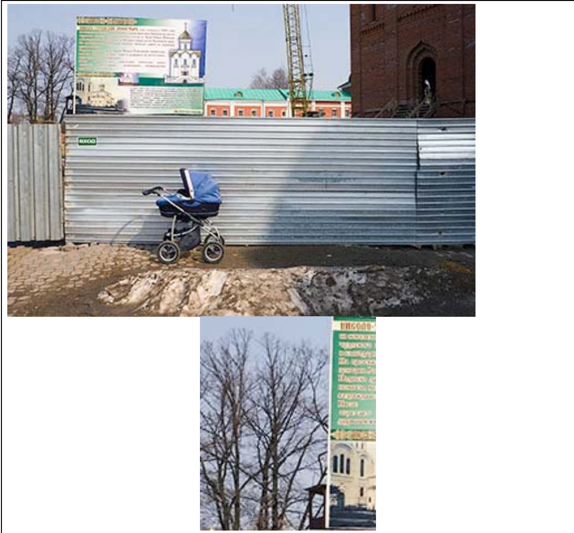
Figure 4b: Correcting for chromatic aberration is best done in the raw conversion and increases the perceived sharpness of the image.