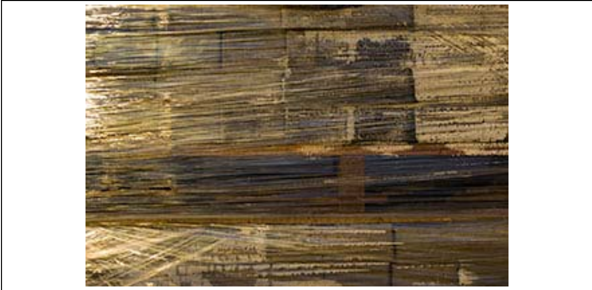
Figure 1a. At first glance this image looks sharp overall.